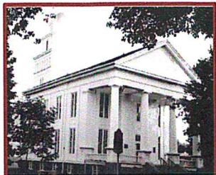
MICHIGAN'S OLDEST COURTHOUSE

255 Clay Street, Suite 301 Lapeer, Michigan 48446